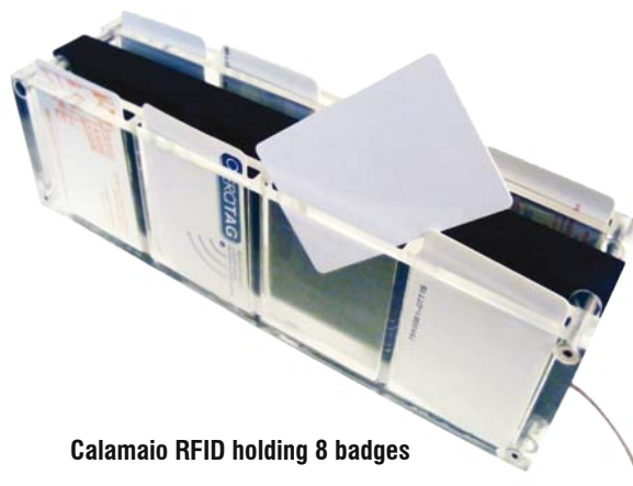
Calamaio RFID holding 8 badges