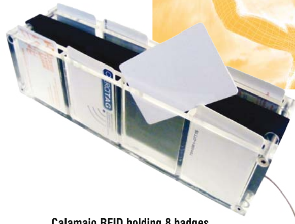
Calamaio RFID holding 8 badges