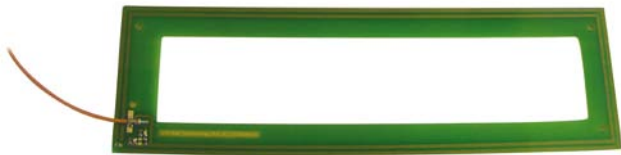
Customized RFID antenna inside

The client was seeking an application that could monitor and control the entire production line. Specifically, processed items, staff involved and the type of operation needed to be identified in all processing phases. The idea was to identify each of these elements, including processed items that could not be identified with sticker labels, with an RFID badge. The solutions on the market at that time were not appropriate to the type of application. In particular, there were no standard RFID products capable of reading up to 8 RFID badges at the same time